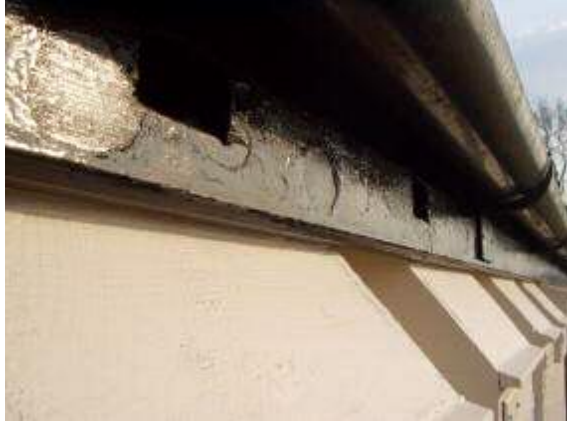
Holes cut in the facing boards let the Swifts reach their nests in the eaves of this chapel

Follow these simple guidelines to comply with the law and keep Swifts safe and breeding in your roof.