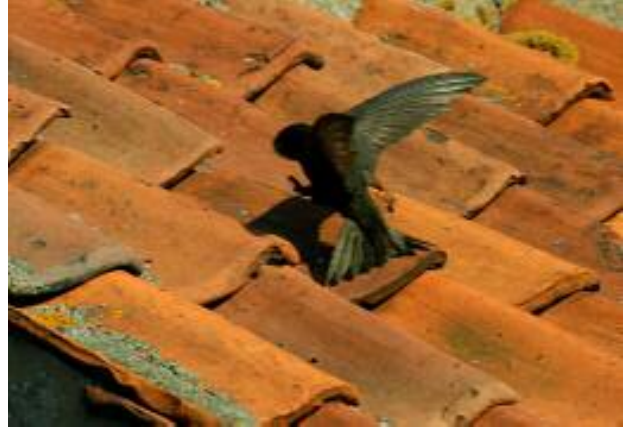
A Swift entering a roof via a displaced pantile. The nest is on the roofing felt below

Follow these rules when working on roofs where Swifts are nesting